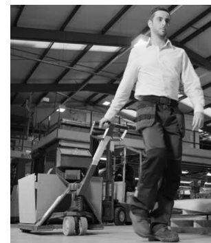
E-Logic's team have the require experience, training and licenses to use warehouse tools, including manual lifts, forklifts and MHE.

Logic's warehousing team has forklift training and licensing.