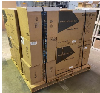
E-Logic has been performing kitting functions since 2007. E-Logic follows industry best practices to manage equipment kitting and shipping.

E-Logic's warehousing team conduct kitting functions consisting of issuing and consolidating hardware materials according to Government provided material list. The materials are segregated and packed as a pallet or a consolidated shipping box (for small items).