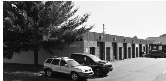
E-Logic has two warehouse facilities. One in Manassas, Virginia and the second location in Doral Florida. From these locations we provide inhouse services for all of our federal government customers.

Staff members assigned to projects are dedicated to meeting our quality assurance and supply chain security goals; a fact that has not gone unrecognized by our clients.