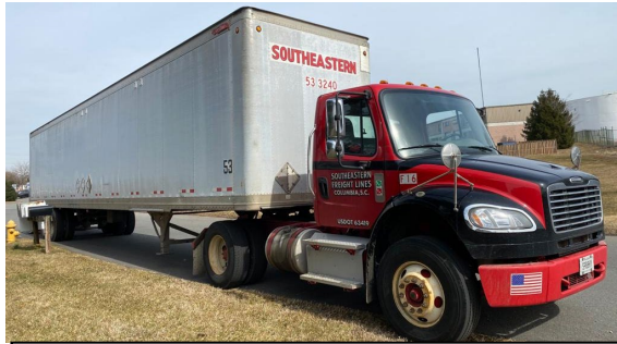
E-Logic has a small fleet of trucks that is available to meet customer requirements. E-Logic's trucks have the required tools/equipment to support the pick-up and delivery per customer requests.

E-Logic provides services including the movement of property, material, supplies, equipment, work-in-process, and related logistics support.